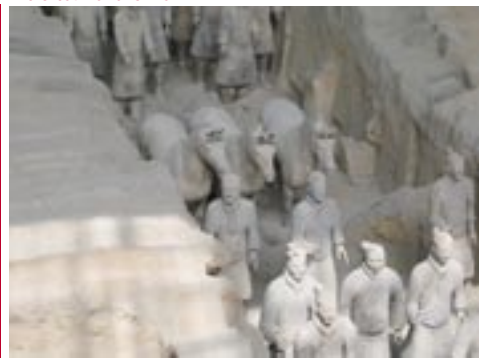
Terra-cotta Warriors, Xi'an, China

China: historical monuments, local markets, plus Japan, Cambodia, Thailand, Korea, Vietnam and Australia