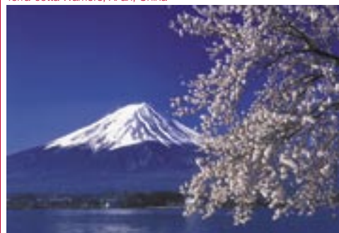
Mt Fuji, Japan, by courtesy of Japan National Tourist Organization

Please complete in CAPITAL letters, place in envelope, attach postage and return to: WCVD6 Congress Secretariat c/o International Conference Consultants, Limited Unit 301, The Centre Mark, 287-299 Queen's Road, Central, Hong Kong