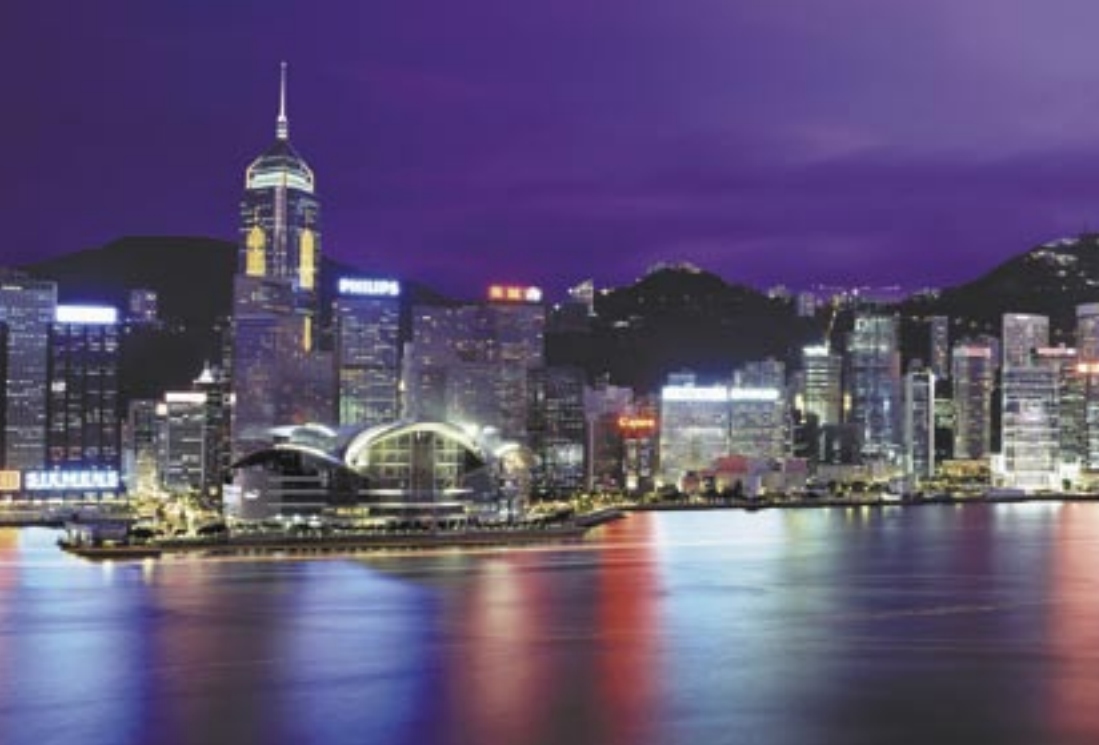
Hong Kong harbour at night