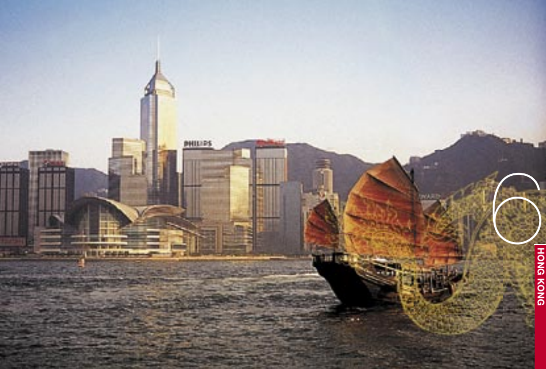
Hong Kong Convention Centre

Our exciting program featuring world renowned speakers combines the most recent scientific advances with comprehensive and advanced tiers of continuing education in the elegant and spectacular Hong Kong Convention Centre. You will gaze upon the memorable awe inspiring harbour while savouring the diverse riches of delicious Asian cuisine. Enjoy the memorable theatre of the traditional Lion Dance. Discover unrivalled tax free shopping opportunities from world famous international brands to unique local products in traditional Asian street markets.